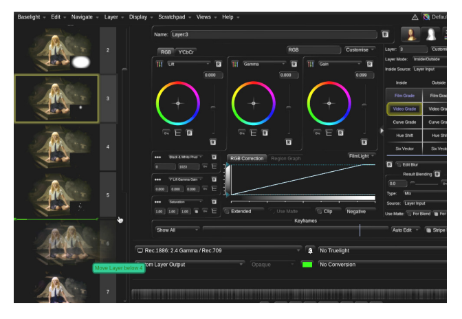
Layer view showing multiple layers and mattes