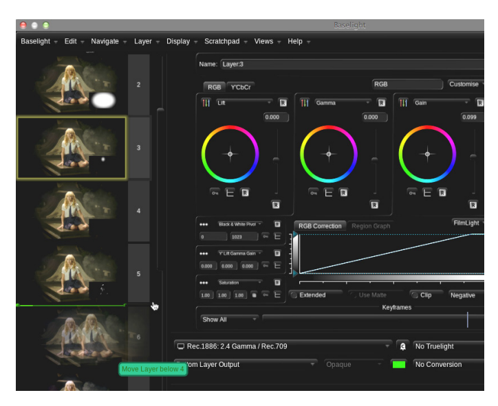
Layer view showing multiple layers and mattes