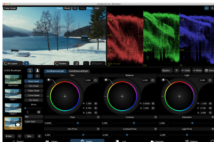
Prelight user interface

Prelight allows images to be colour corrected interactively—by live updating LUT boxes, cameras or monitors directly, or by processing RAW files. Looks can be created and previewed on set or in down time on imported image files, safe in the knowledge that the description of that look is going to be truly relevant and useful.