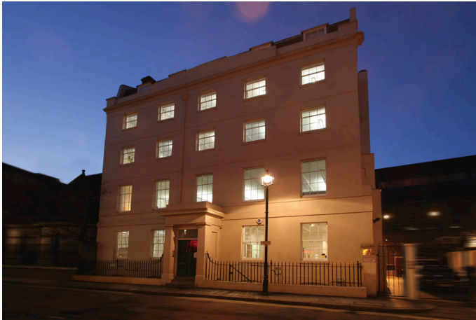
FilmLight's Soho headquarters

Headquartered in London's Soho, FilmLight is right at the centre of the UK's video and film post-production industry. That means we have a close relationship with the people who actually use our technology - although with 80% of sales made outside the UK, this is also a strongly international operation.