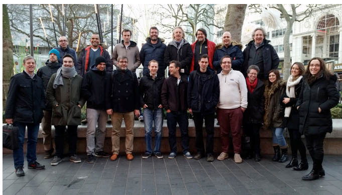
The FilmLight crew on the way to The Hateful Eight - Ultra Panavision 70mm Presentation

Specialising in colour manipulation, our systems are used on everything from A-list Hollywood blockbusters, like The Hateful Eight, all the way through to art house movies, TV dramas, commercials, even natural history programmes. In fact, any moving image production where the quality of the final result and creative input are paramount.