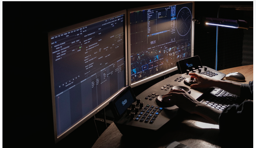
Slate control surface

Baselight S can utilise the portable and easily deployable Slate, while Baselight M supports both Slate and the full-size Blackboard Classic. Support is also provided in both products for third-party control panels.